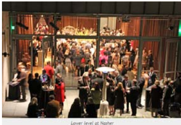
Lower level at Nasher

But all the action was not at the ground-floor patron party and galleries. The lower level, where the Nasher Salons are staged, had been totally disguised with wall drapings and in the center of the room was a big-as-the-Arboretum floral centerpiece around which food was being prepared. Despite the size of the arrangement it might have been a challenge to have seen it, since the room was more than overflowing with guests.